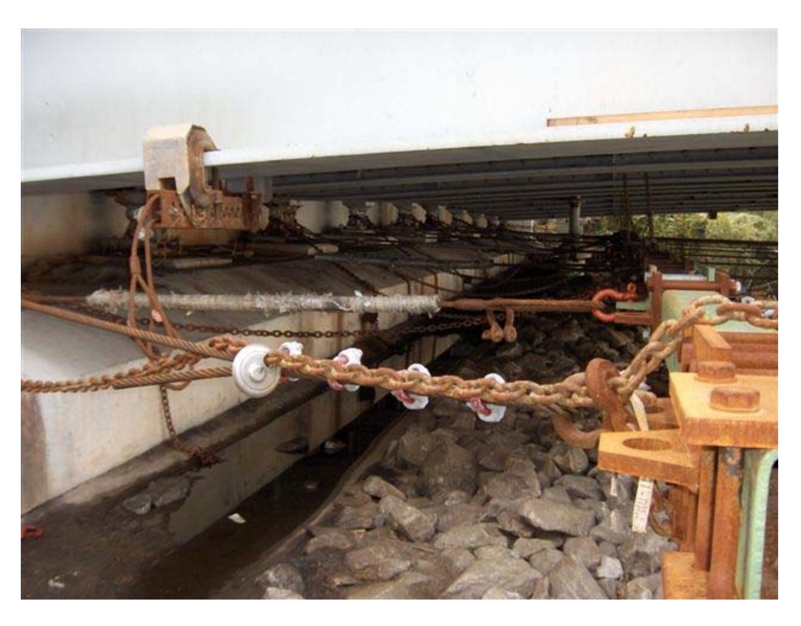
Horizontal Tie Back Assemblies Horizontal Support Beam To Bridge Bearings