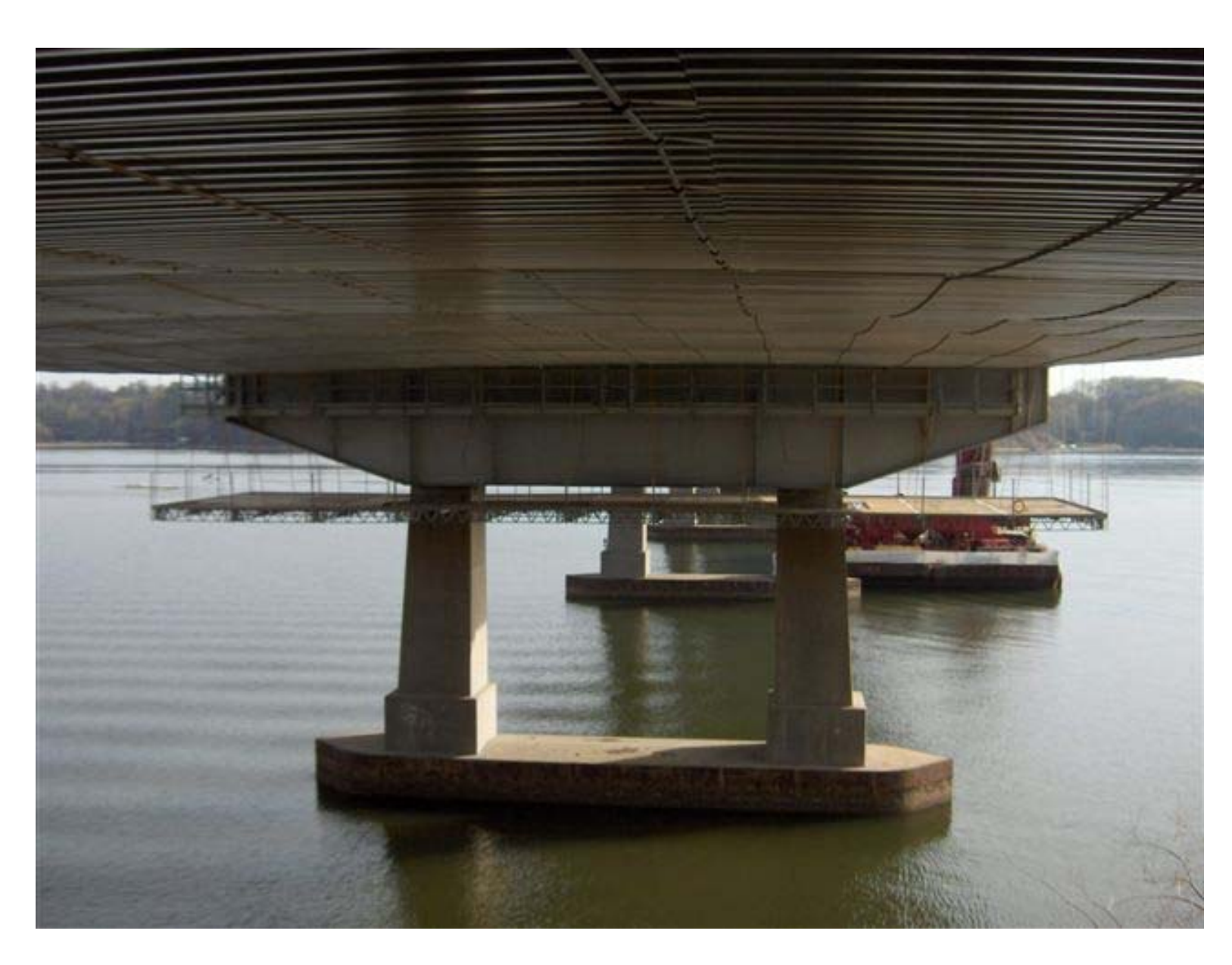
Cable Supported/Metal Deck Platform System