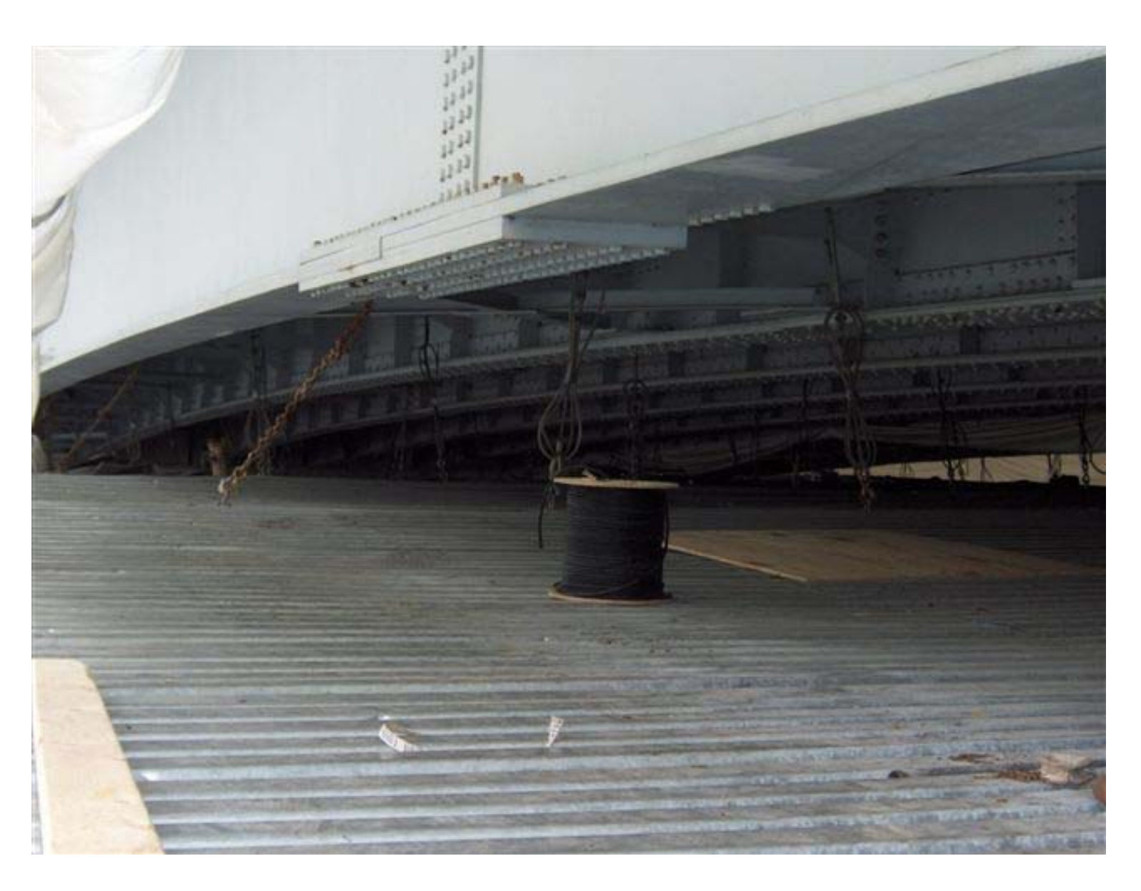
Cable Supported/Metal Deck Platform System