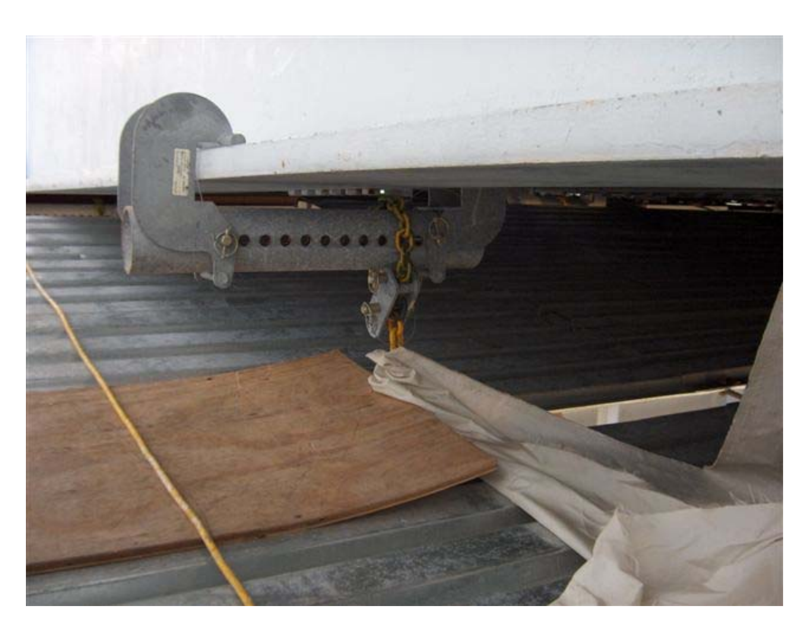
Beam Flange Clamp Hanger Vertical Support