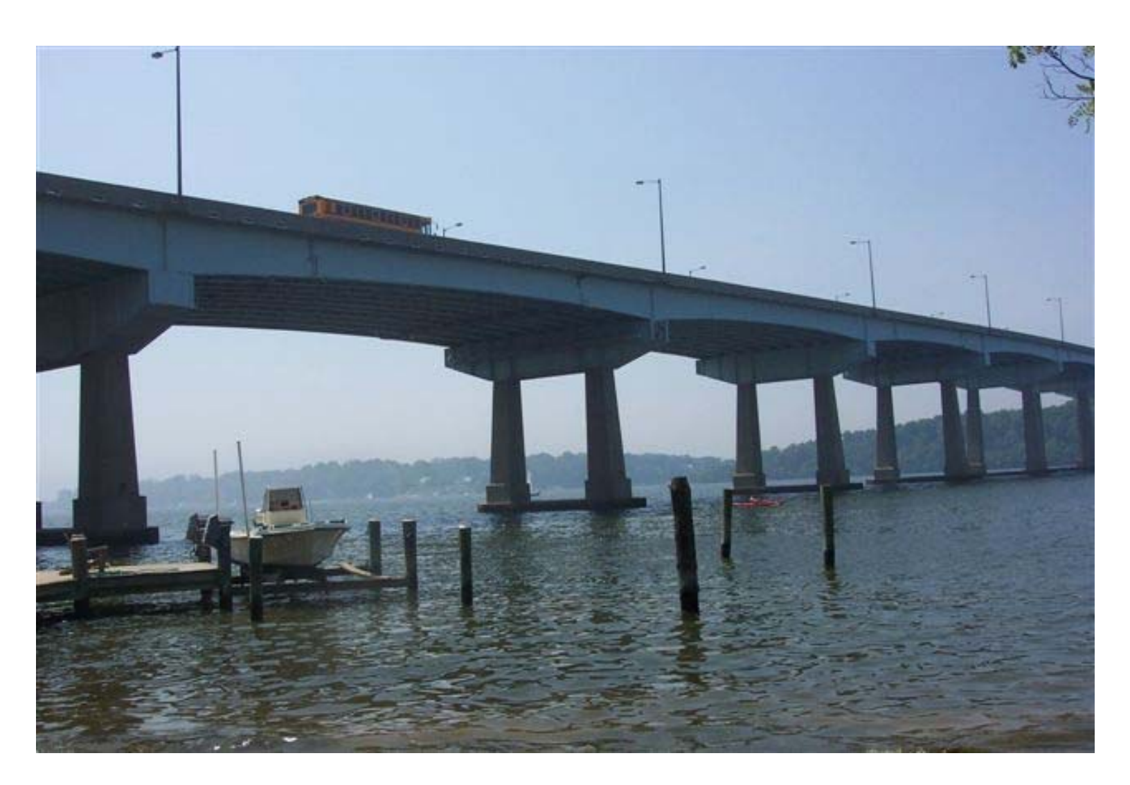
17 Span Girder Bridge (US Rte. 50) Over The Severn River

PROJECT DESCRIPTION: Cleaning & Painting Project – Quik Deck/Cable Supported Metal Deck Platform System